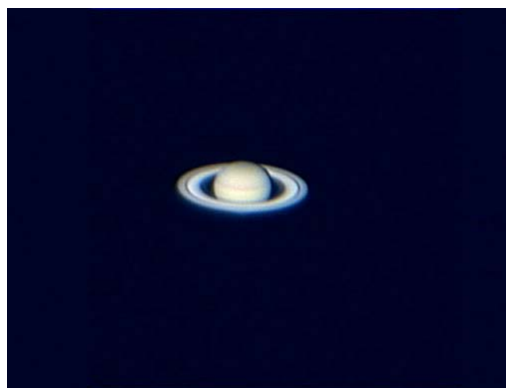
Photo taken on Saturday, November 13 with a Canon 20D digital SLR camera with 500mm f/8 lens, ISO 800, 10 minutes exposure. The camera was mounted on top (piggyback) of the Henry Lee telescope at Hallam observatory.