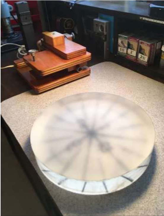
The mirror after fine grinding with Silicon Carbide #500. The surface at this point has become velvety smooth to the touch, but is still a very long way from the super-smoothness that polishing will eventually create. The radial lines that are drawn on its back side, seen fairly clearly through the pyrex, are used to gage the rotation of the disc under the hands while manipulating it over the tool on the grinding stand. Note the beautifully crafted, homemade Foucault tester in the background that will eventually be used in the all-important parabolizing process, once a good polish is established.

The tall, slender grinding stand may have been inspired from a style seen in an old, musty Sam Brown guide which also lay in the bottom of the box. I recognized it, too; for I'd had my nose in my own copy of that author's classic, "All About Telescopes" far too long back in the day to forget its many simple but compelling illustrations. It was a little rickety now, but the wood it was made from was still good, so I cleaned it up, replaced the old spike nails hardware with some stronger woodscrews, and gave its bare wood a coat of paint; not so much for looks as for a smoother surface that could be more easily cleaned. Finally, some weight added to the base made this once again an excellent stand on which to do work.