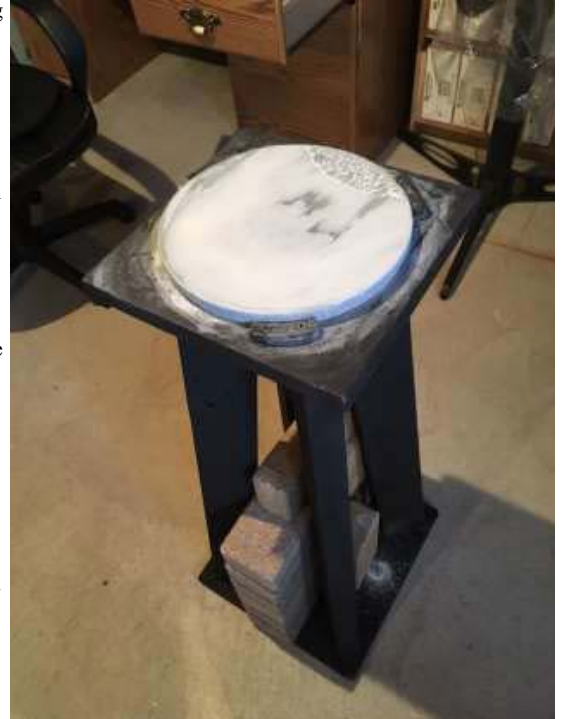
Several heavy paving stones are seen placed on the base of the waist-high stand, to improve its steadiness for the grinding and eventual polishing stage. Note the plate glass "tool" is coated with spent silicon carbide following a grinding session.

I have progressed without incident, though admittedly rather slowly, and have just finished with Silicon Carbide #500 and am ready now to change over to 12-micron White Aluminum Oxide to begin the very fine grinding process. All my work so far has been done out in the garage, usually at night with the radio playing and being careful to work only when the temperature hovers around the 20 – 23 Celsius or so, range. There is only so much time to devote, so my habit has been to work through a grade of powder uninterrupted from start to finish, then do a thorough clean up and leave it for a time before doing the next. Slow and steady.