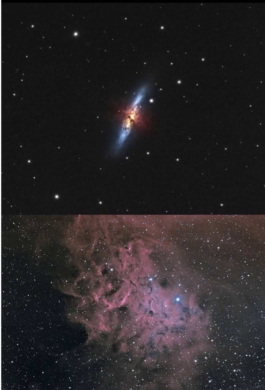
M82 (top) and IC 405 Flaming star (bottom): Altair Astro 115MM F5.8 EDT, Altair Astro 183~IMX Hypercam Mono, IOPTRON IEQ 30 Pro - 10 hours of total exposure for IC405.