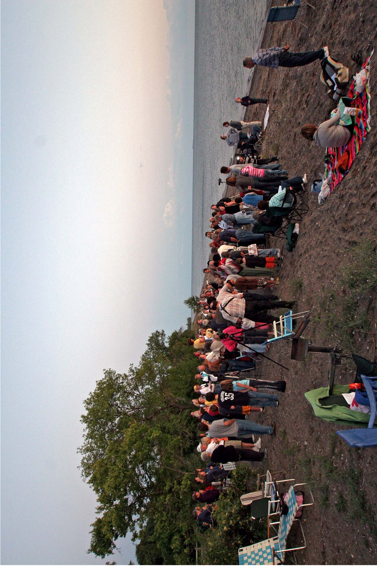
On Saturday, August 2nd the Windsor Centre along with the "Friends of Point Pelee" held a public viewing session at Point Pelee National Park on the West Beach. Over 150 people attended with adults paying a $5 admission. Proceeds were split between both groups and we raised $255. The night was clear and we all witnessed a beautiful sunset, Space Station pass, a fireball (extremely bright meteor) and many deep sky and solar system objects. We had over a dozen telescopes on the beach and the only regrettable thing was we had to shut down at 11:00 p.m.. Thanks to everyone who helped out!