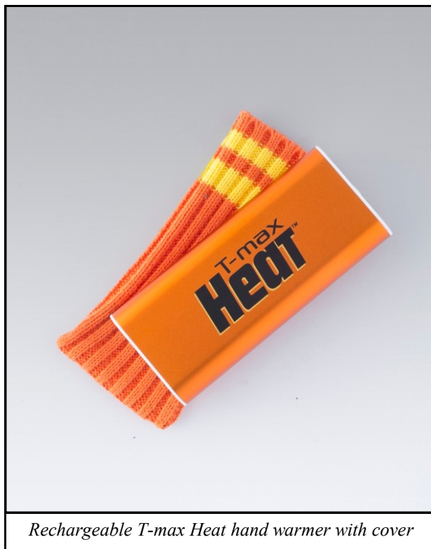
Rechargeable T-max Heat hand warmer with cover

* T-Max is part of Wind River brand, sold at Marks Work Warehouse in Canada.