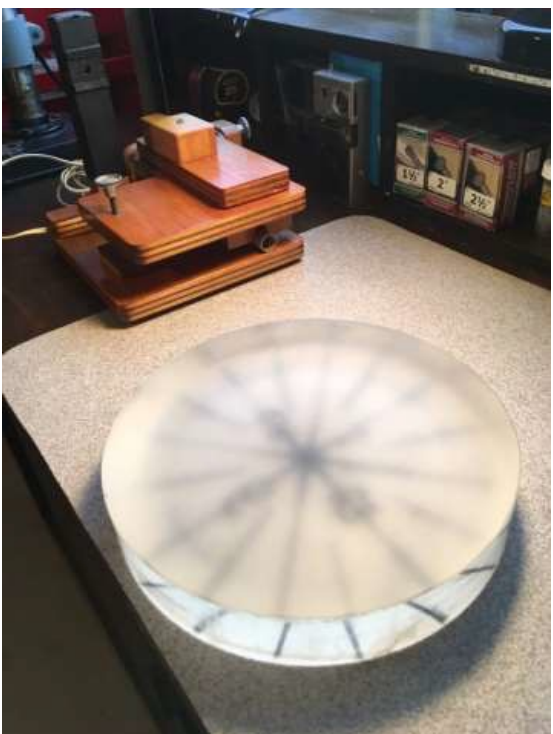
The mirror after fine grinding with Silicon Carbide #500. The surface at this point has become velvety smooth to the touch, but is still a very long way from the super-smoothness that polishing will eventually create. The radial lines that are drawn on its back side, seen fairly clearly through the pyrex, are used to gage the rotation of the disc under the hands while manipulating it over the tool on the grinding stand. Note the beautifully crafted, homemade Foucault tester in the background that will eventually be used in the all-important parabolizing process, once a good polish is established.

The tall, slender grinding stand may have been inspired from a style seen in an old, musty Sam Brown guide which also lay in the bottom of the box. I recognized it, too; for I'd had my nose in my own copy of that author's classic, "All About Telescopes" far too long back in the day to forget its many simple but compelling illustrations. It was a little rickety now, but the wood it was made from was still good, so I cleaned it up, replaced the old spike nails hardware with some stronger wood screws, and gave its bare wood a coat of paint; not so much for looks as for a smoother surface that could be more easily cleaned. Finally, some weight added to the base made this once again an excellent stand on which to do work.