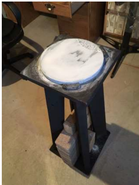
Several heavy paving stones are seen placed on the base of the waist-high stand, to improve its steadiness for the grinding and eventual polishing stage. Note the plate glass "tool" is coated with spent silicon carbide following a grinding session.

I hope that I will be able to write another successful installment to this article in a future addition of Aurora . In the meantime, please wish me luck!