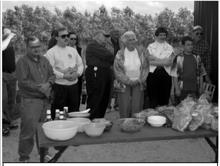
The annual picnic was well attended and was the first to take place at the Windsor Centre Observatory (Hallam Observatory) site in Comber. Picnicers enjoyed a great BBQ and a couple of short speeches.